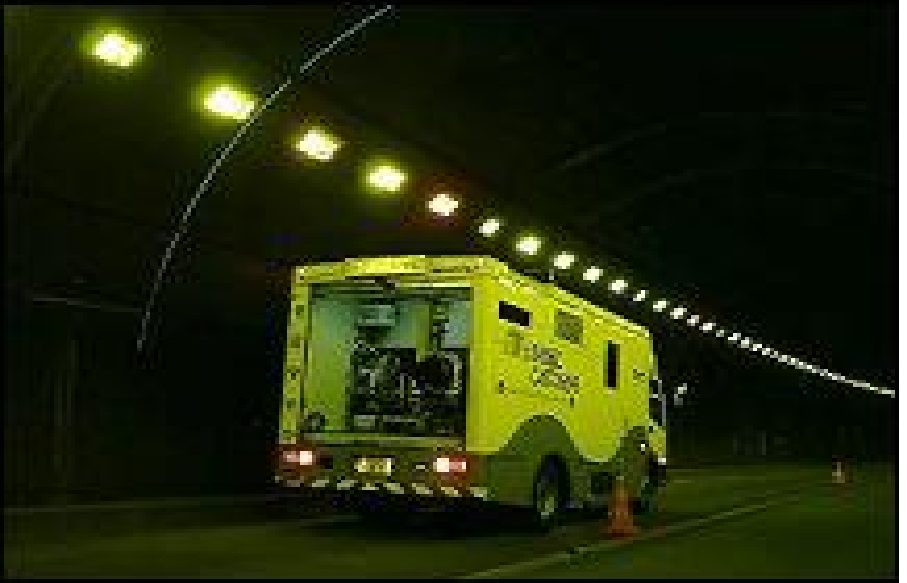
Tunnel inspection using High-Speed Concrete-crack Measurement Vehicle