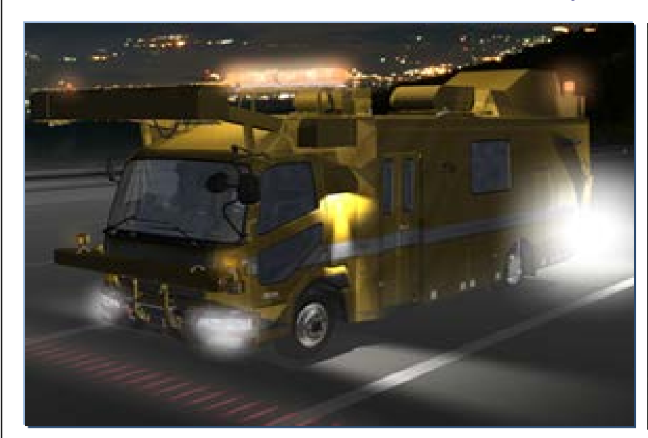
Pavement inspection using High-Speed Road Measurement Vehicle