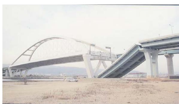
(Damages by the Hyogo-ken Nanbu Earthquake in 1995)